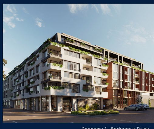
Spencer: 1 - Bedroom + Study