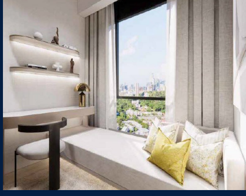
4 - Bedroom + Home Office