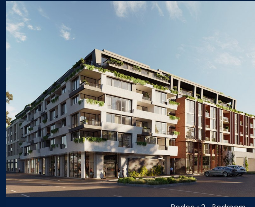
Roden: 2 - Bedroom