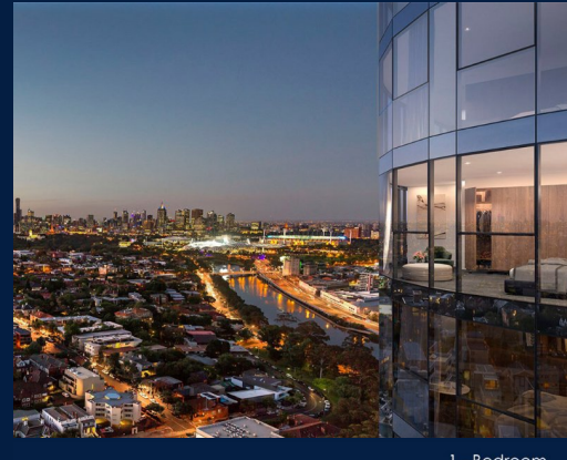
I - Bec