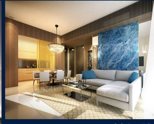
3 - Bedroom Unit